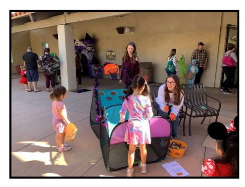
More than 500 children and adults enjoyed the Halloween Carnival at the Poway Library. The carnival was organized by the National Charity League in partnership with the library and sponsorship by the Friends of the Poway Library.