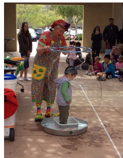
Sparkles the Clown – Library Love February 10

*Please stop by and introduce yourself to Jodi next time you are in!