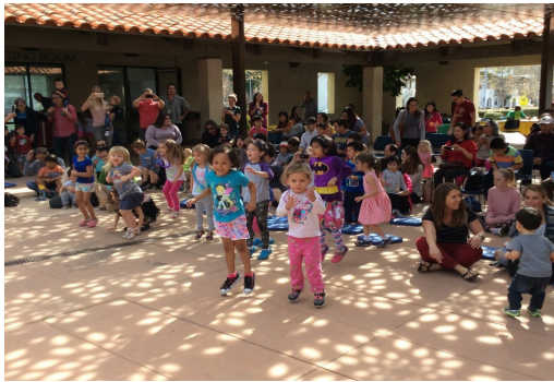
Hullabaloo & FOL Pancake Breakfast Library Love February 17