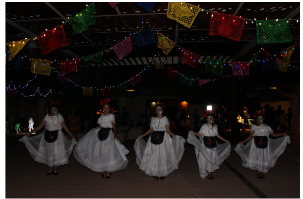
Balet Folklorico performance by Arco Iris