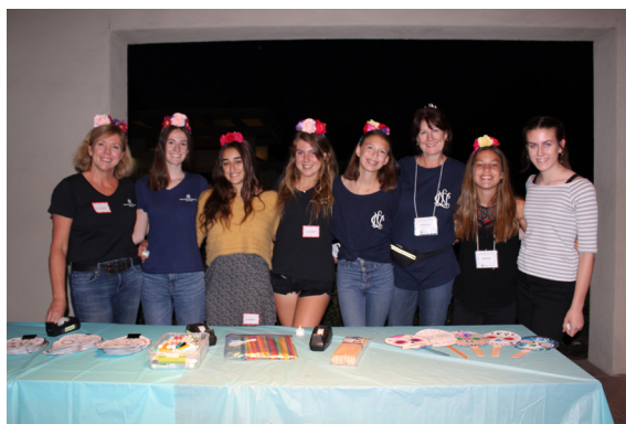
National Charity League volunteers pose by the craft table.