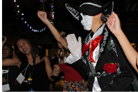
Teen volunteers dancing the night away.