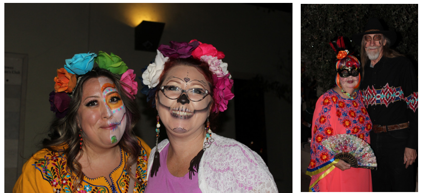
More Costume fun!