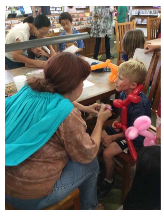
A young muggle transforms into Harry Potter.