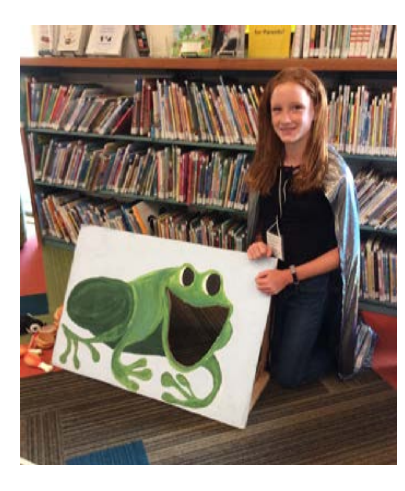
NCL volunteers greet customers attending the Care of Magical Creatures class.