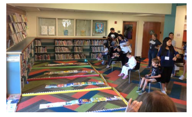
Customers enjoy droid racing in the library.