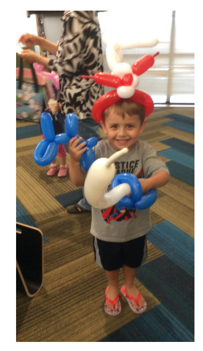
Future Hogwarts students show off their transfiguration skills.