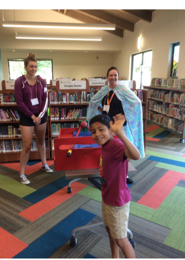
A young wizard plays the Bludger training game. The game is used by Hogwart students to prepare to play Quidditch.