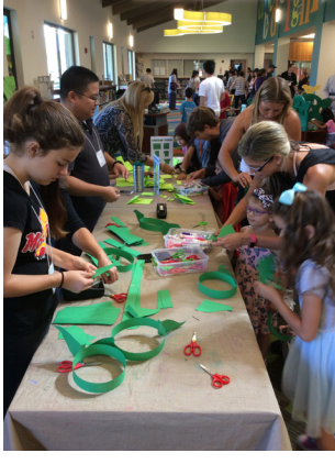
Hard at work on Yoda ears and origami Yodas.