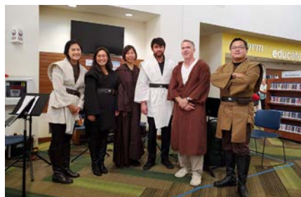
Members of the Winecreek Ensemble pose.

Their event-themed music was amazing and made our event even better than we could have imagined. If you have not already seen, there is some fantastic footage of the group performing while the 501st cosplay participants march into the library on the branch's Facebook page. We received so much positive feedback from this musical addition. Friends supported the program by purchasing Otter Pops, which were turned into light sabers, and providing financial support for the various craft stations, which included Yoda Ears, origami Yodas and pool noodle light sabers.