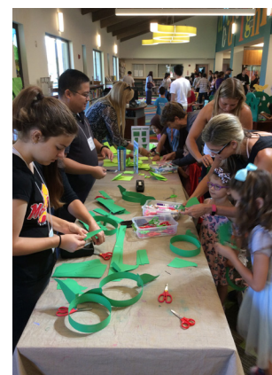
Hard at work on Yoda ears and origami Yodas.