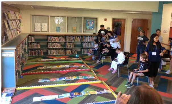
Customers enjoy droid racing in the library.