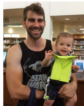
Dad and his baby enjoy the festivities

Thanks to the Poway Friends, we were able to host some incredible programs this summer, from the Harry Potter Party to a Luau to Kids Fest to a Paint Night for adults to providing grand prize certificates to local businesses!