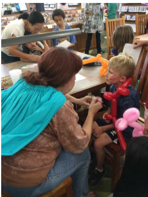
A young muggle transforms into Harry Potter.