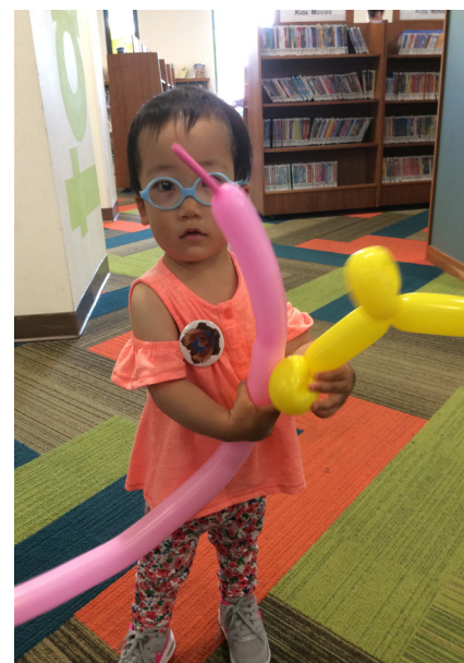
Future Hogwarts students show off their transfiguration skills.