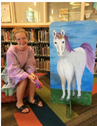
NCL volunteers greet customers attending the Care of Magical Creatures class.

Tuesday, July 23 we celebrated Harry Potter’s Birthday with a variety of Hogwart’s-themed crafts and stations, including a Sorting Hat station, Defense Against the Dark Arts area, and the Care of Magical Creatures. Check out some of the highlights below.