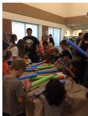
Customers make Star Wars light sabers from pool noodles.