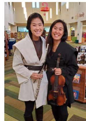
Members of the Winecreek Ensemble posing.