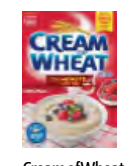
Cream of Wheat Original 2 1/2 minute