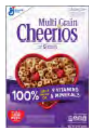
Cheerios Multi-Grain GF