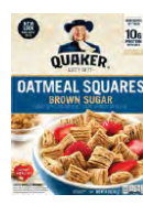
Oatmeal Squares Brown Sugar