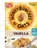
Honey Bunches of Oats Vanilla