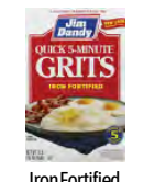
Iron Fortified Quick Grits