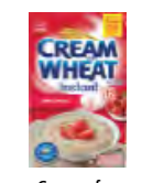
Cream of Wheat Original Instant