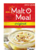
Hot Wheat Original