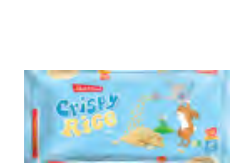
Crispy Rice GF