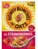
Honey Bunches of Oats with Strawberries