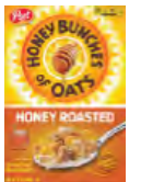
Honey Bunches of Oats Honey Roasted