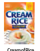
Cream of Rice 2 1/2 minute