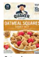
Oatmeal Squares Honey Nut