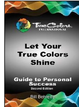
Let Your True Colors Shine Guide to Personal Success