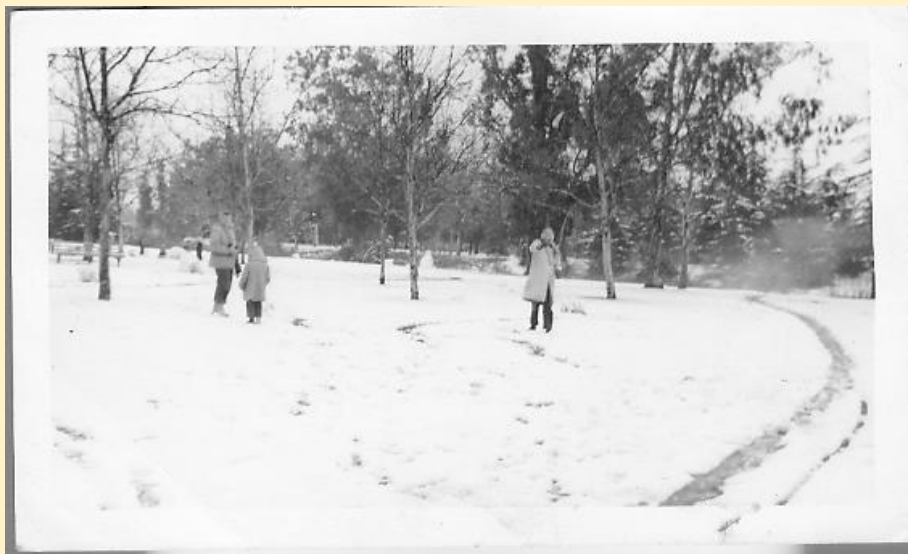
Snow! 1940's Valley Village Park - Pre-170 Freeway