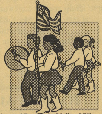
Annual Parade in Valley Village

Celebrate the 4 th of July with your friends and neighbors in Valley Village. This year the Fourth will be on Tuesday. Make it another triumphant parade throughout our community. We will start at 10:00am at the Addison Street parking lot of Colfax Elementary School and culminate at the Valley Village Park on Westpark Drive. We will have a fife and drum trio to lead us. The North Hollywood division of LAPD will provide an escort, sirens and all. There will be refreshments at the park. Decorate your bike, trike, wagon, stroller, your dog and yourself. If you are not going to be in the parade, come out and cheer on the marchers.