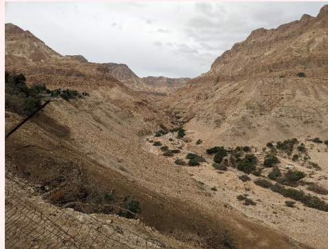
The Judean Wilderness looking north from the Dead Sea