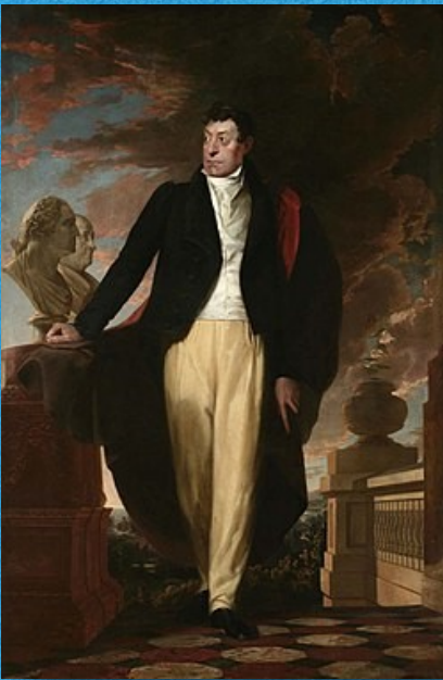
Portrait of Marquis de La Fayette by Samuel F. B. Morse, 1826, oil on canvas, New York City Hall

6:45pm — The walking tour continues to Fort Stanwix National Monument.