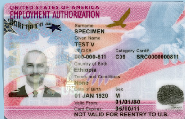
2x2 PASSPORT PHOTOS