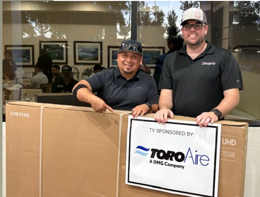
Above: Grand prize raffle winner - 75" TV donated by Toro Aire

Friday April 11 at Los Serranos Country Club