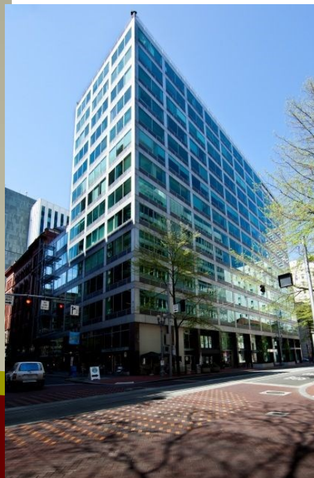
Equitable Building, Portland, Oregon