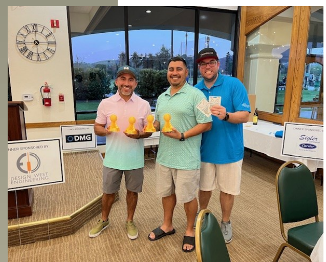
First Place Team: Sigler Group

At Los Serranos Country Club, 15656 Yorba Ave, Chino Hills, CA 91709