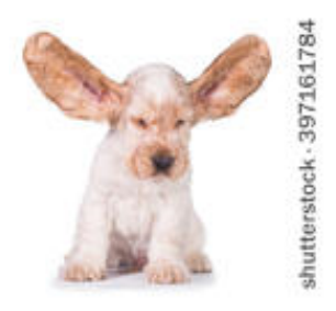
Whelping Box News: None