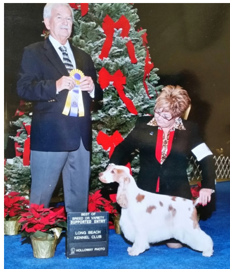
BISS GChB Barrister Hocus Pocus, RN. Feb. 17, 2007 -- May 29, 2019