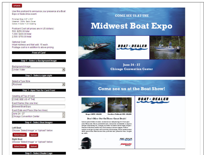
Direct Mail Customization Page