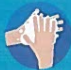
SCRUB: 20 SECONDS