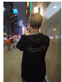
Night out on the town in New Balance Shadow Project Gear

For more information, please contact shadow.project.tc@gmail.com and follow us on Instagram at Shadow Project Running (@shadowprojectrunning).