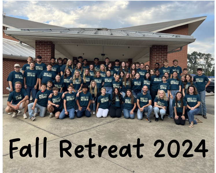
Fall Retreat 2024