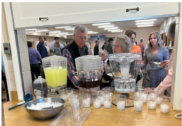
What a Crowd!!