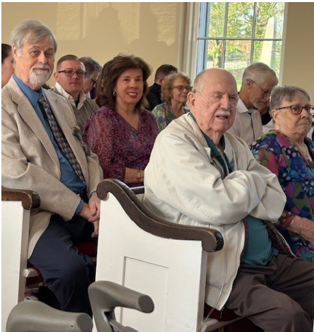
Gathering for Worship On Easter Sunday