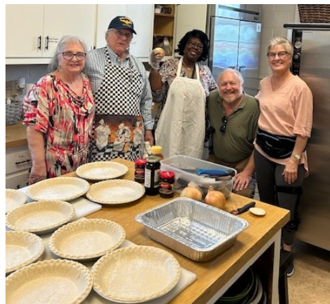
Great group of cooks making some delicious pies!