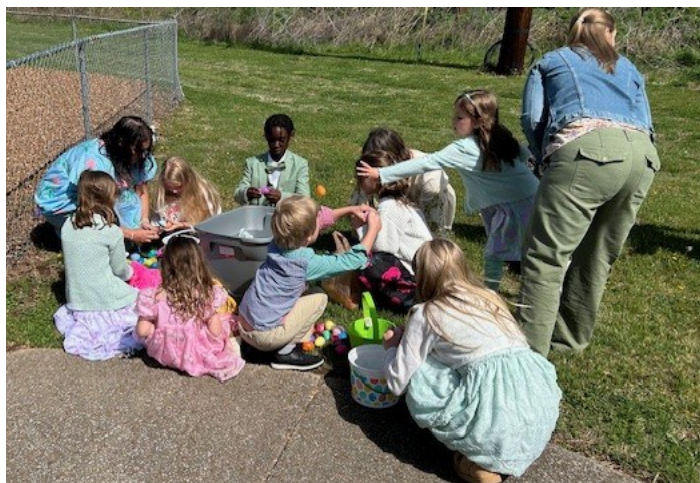
The Children had a great time hunting Easter eggs!