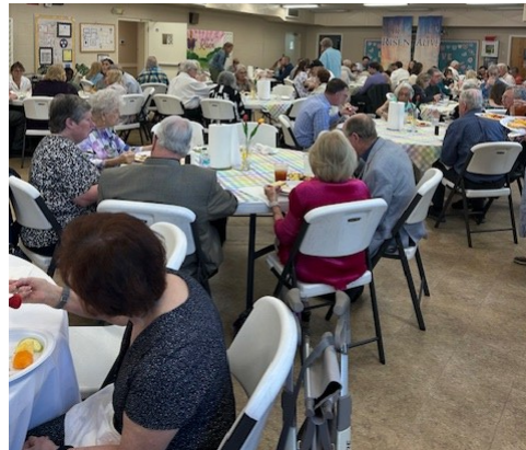
Standing Room Only!