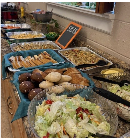
What a spread!