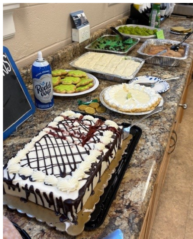
Delicious looking desserts!