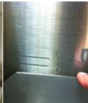
2b. Water Level

2. Make sure the drain Valve on the Tank is in the CLOSED position 2b.) Using Hot water, fill the tank to the marked water line