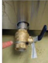
2. Drain Valve