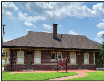
Laurel Heritage Museum