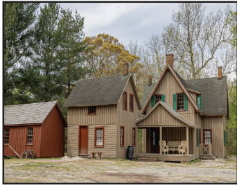
The Hitchens Homestead