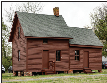
The Mill-Hand House