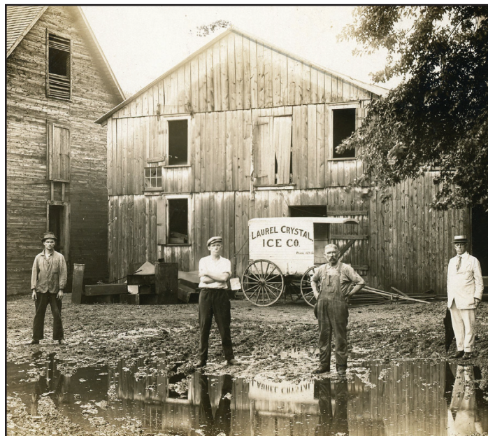
Laurel Crystal Ice Co., c. 1910.