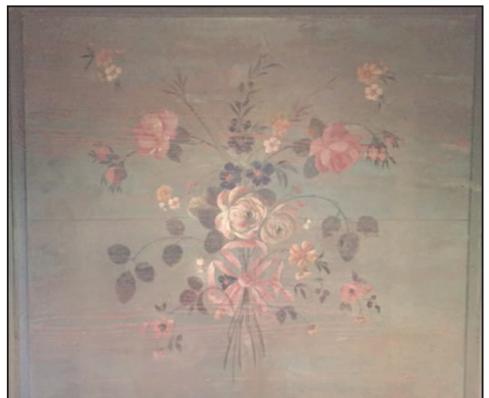
Similar artwork from Newbold Vinson's house at Trap Pond, c. 1791.