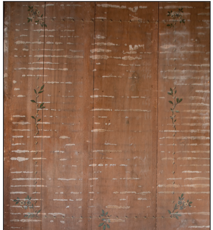
One of the two sets of decorated panels.

of both homes show very similar accomplishments. The brushwork used in both are very similar in their execution. Also, the use of the bellflower motif in each of the artist's efforts may suggest a shared source. Finally, both homes are from the same time period and have relative physical proximity to one another. For all of these reasons, one could suggest that there is the possibility that the same artist decorated both homes with decorative features. 🌿