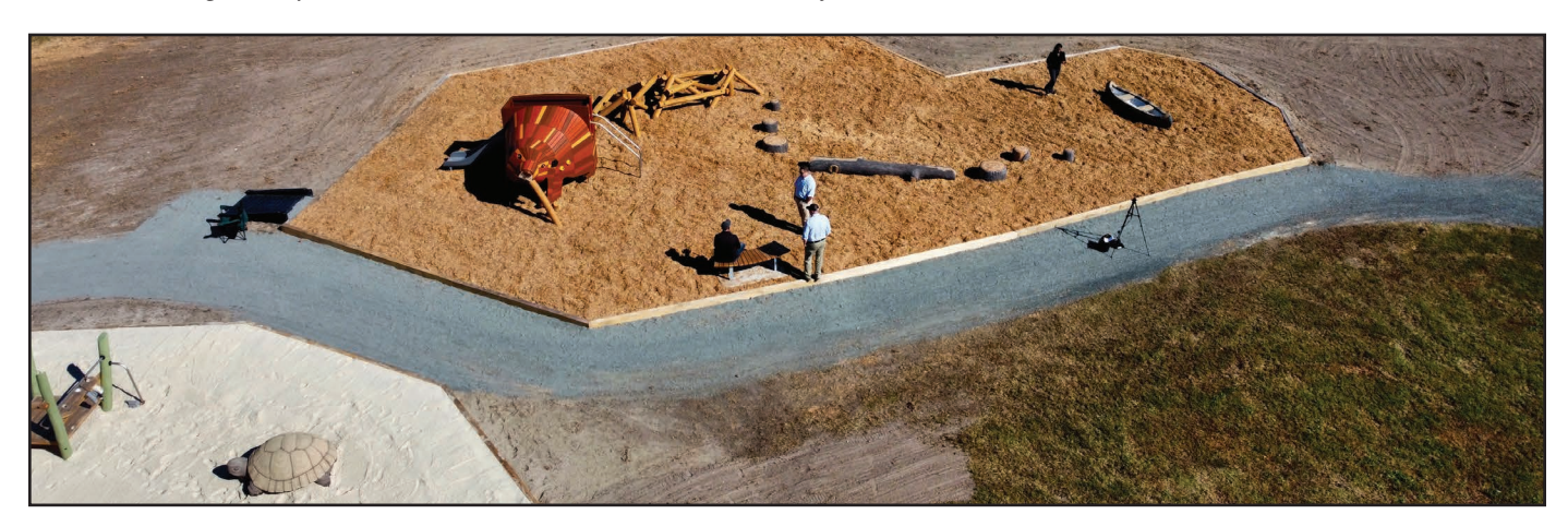
An aerial view of the first phase of Tidewater Park. "Turtle Island" and "How the Beaver Got Its Tail." All photos and captions courtesy of Lee Ann Walling.