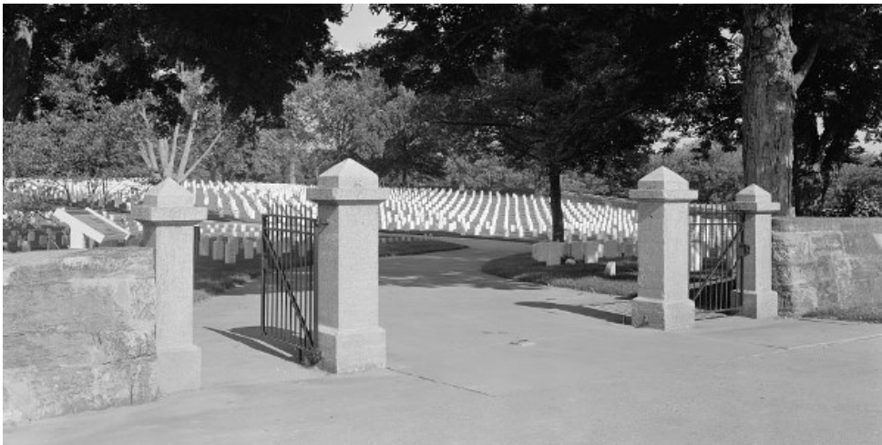
CAMP NELSON CEMETERY, KENTUCKY