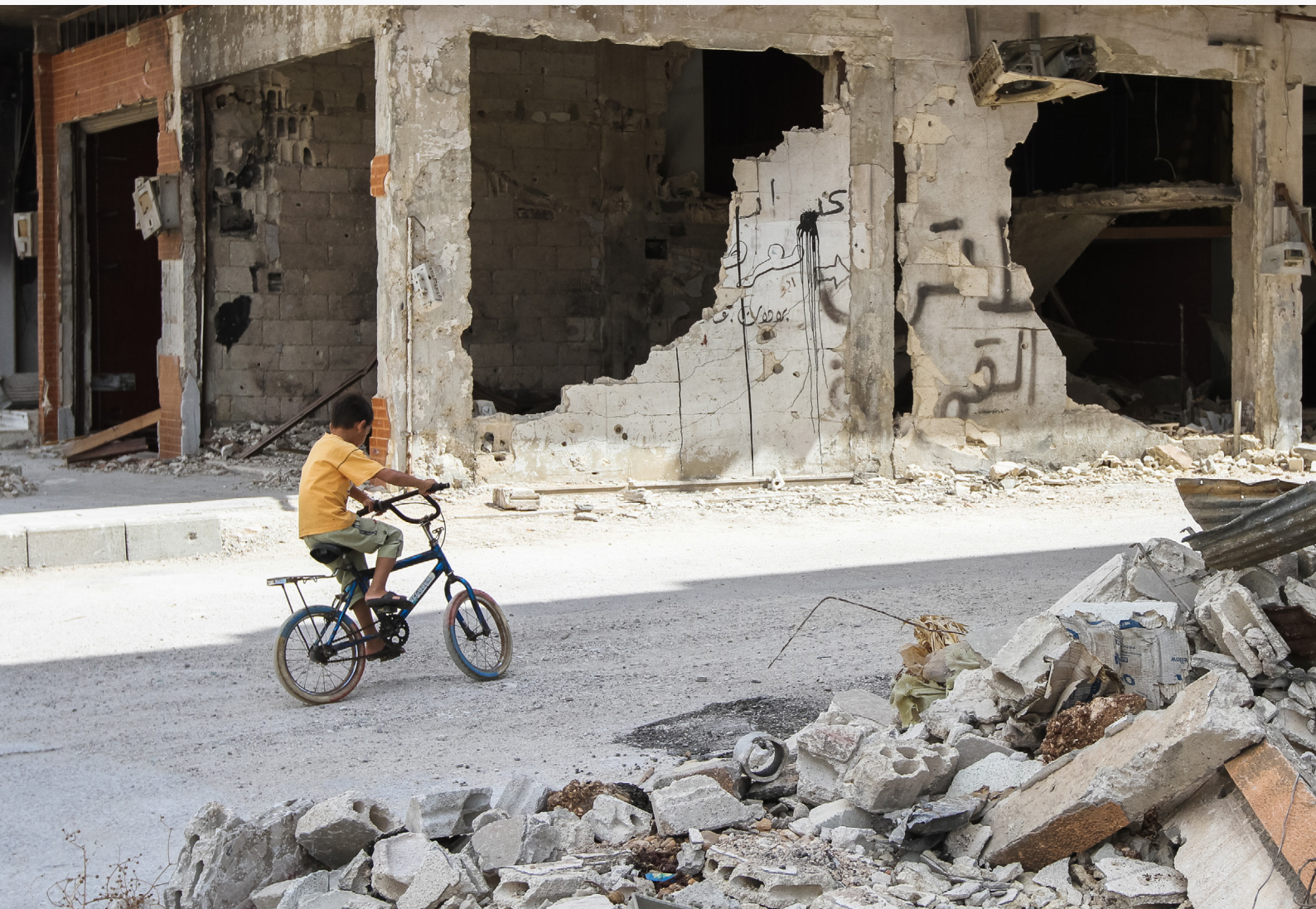
Homs, Syria September 2013