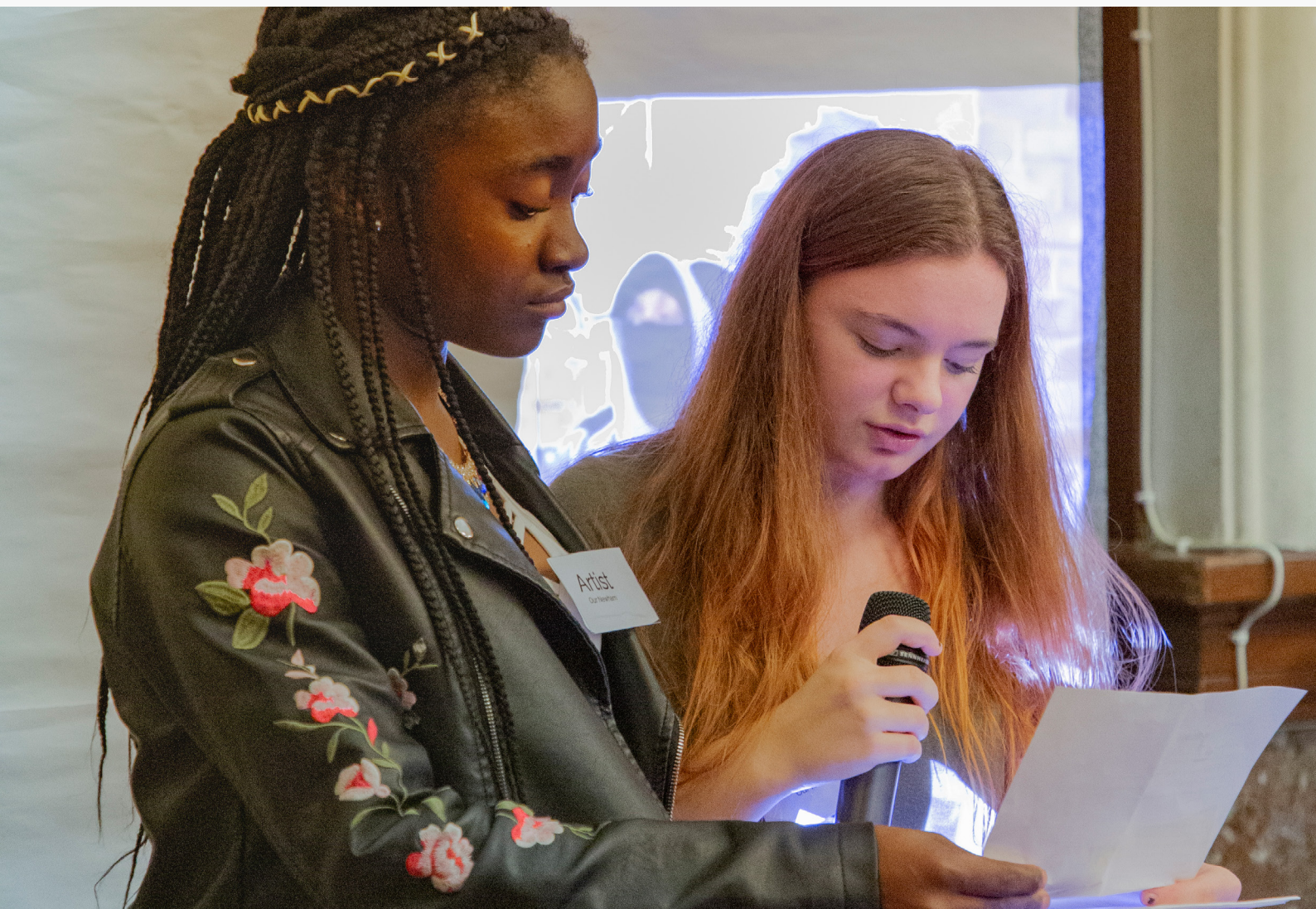
Public poetry reading by young people from Little Ilford Youth Zone at Newham Town Hall, funded by the Mayor of London's Young Londoners Fund,