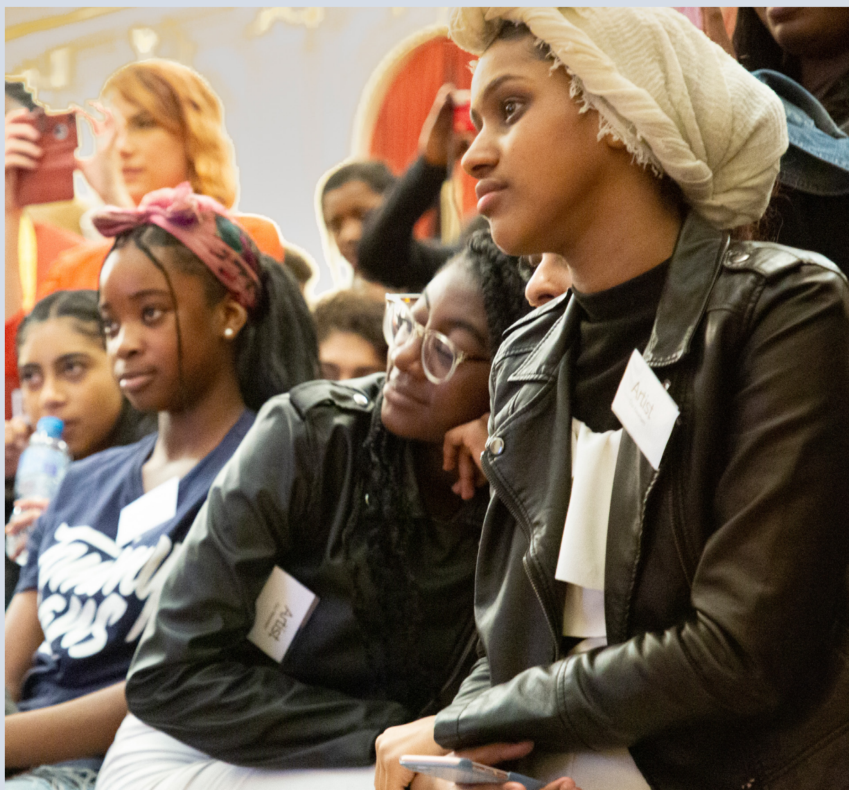
‘Our Newham’ A showcase of art produced by young people living in Newham, 2019

At the same time, PA established a project across Newham and its neighbouring boroughs that works with members of marginalised and excluded groups – particularly youth – to explore their personal experiences of prejudice through photography, painting, and other media. Their art and stories subsequently served as the basis for a series of exhibitions that started conversations among young people, community leaders, local officials, and police on the root causes of discrimination and marginalisation. After viewing the exhibition, the head of one borough council told participants that “Everyone needs to see this. . . . Keep making sure people like me understand what I’m here to do, and [that] I’m here to do it for you.” These kinds of exchanges have helped facilitate community-driven change in some of the capital’s most disadvantaged areas.