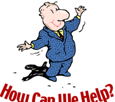
How Can We Help?