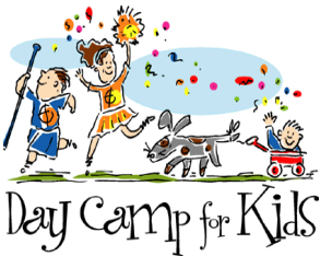
Day Camp for Kids