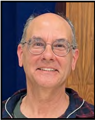
Bark House Under Oak