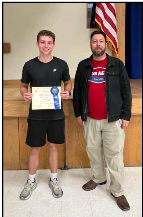
Buchanan High School