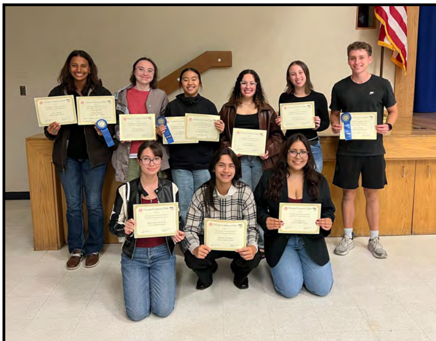
PSA Youth Showcase Students attending our meeting