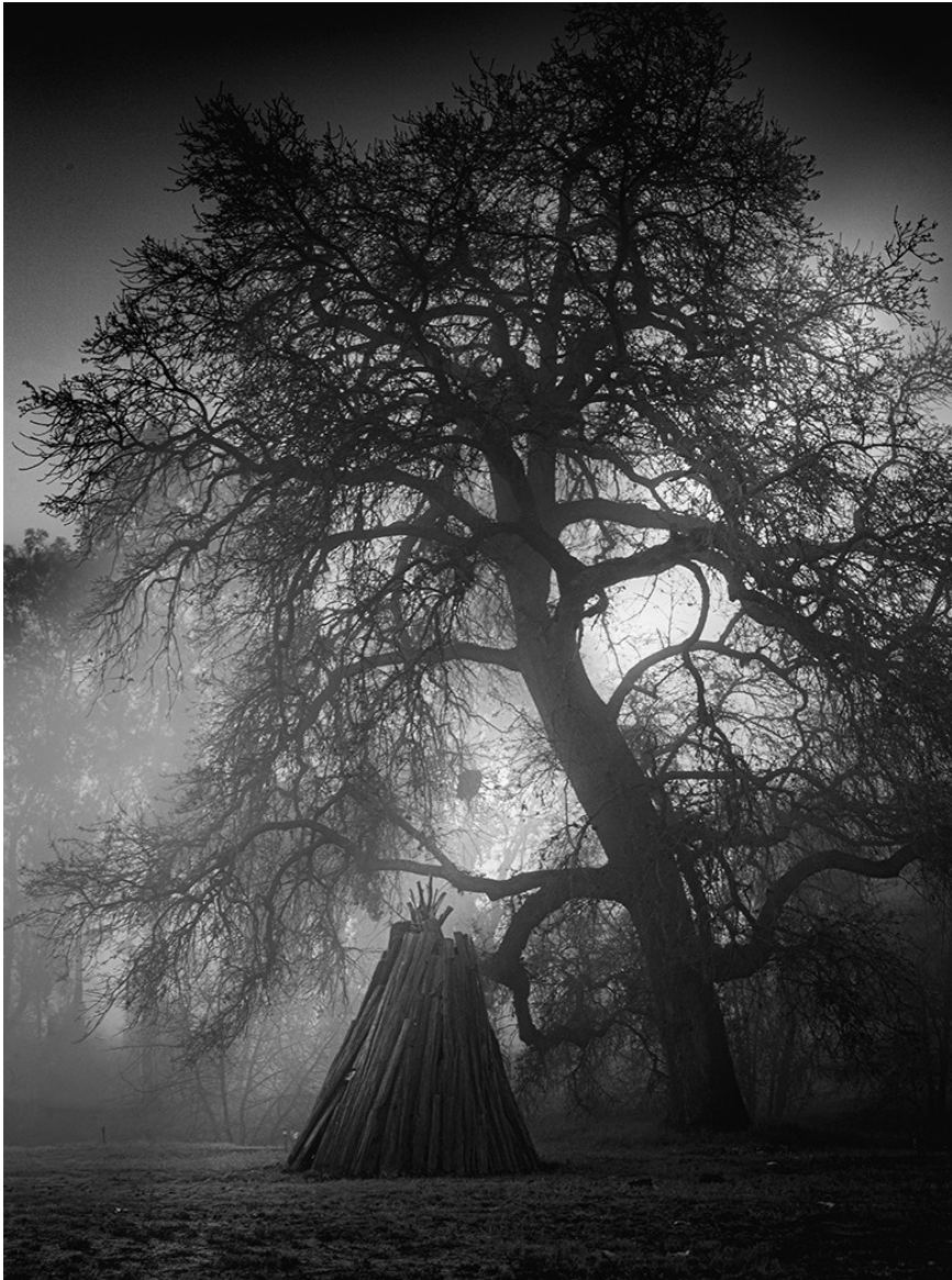
Bark House Under Oak