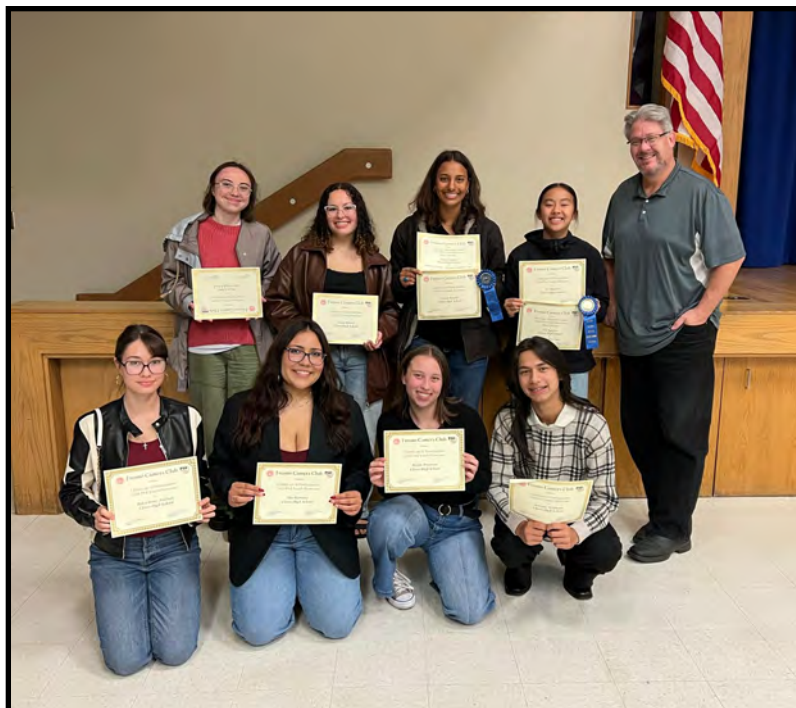
Clovis High School