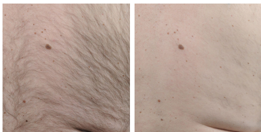
Before and after 1 treatment