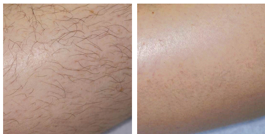
Before and after 3 treatments