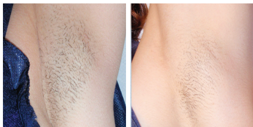
Before and after 1 treatment