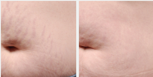
Before and after 3 treatments