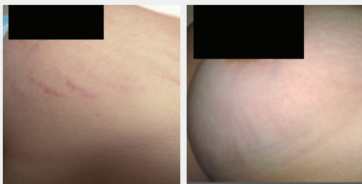
Before and after 3 treatments