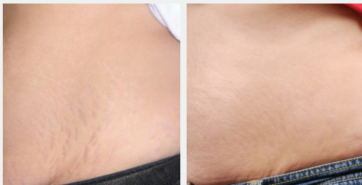
Before and after 3 treatments