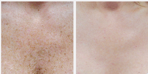
Before and after 2 treatments