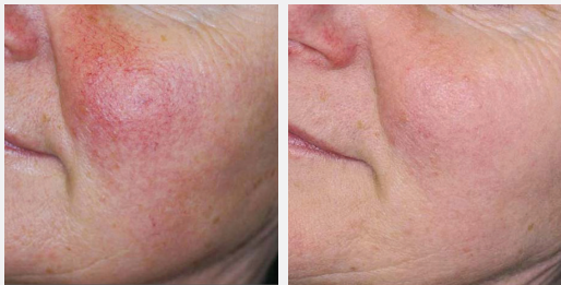
Before and after 3 treatments