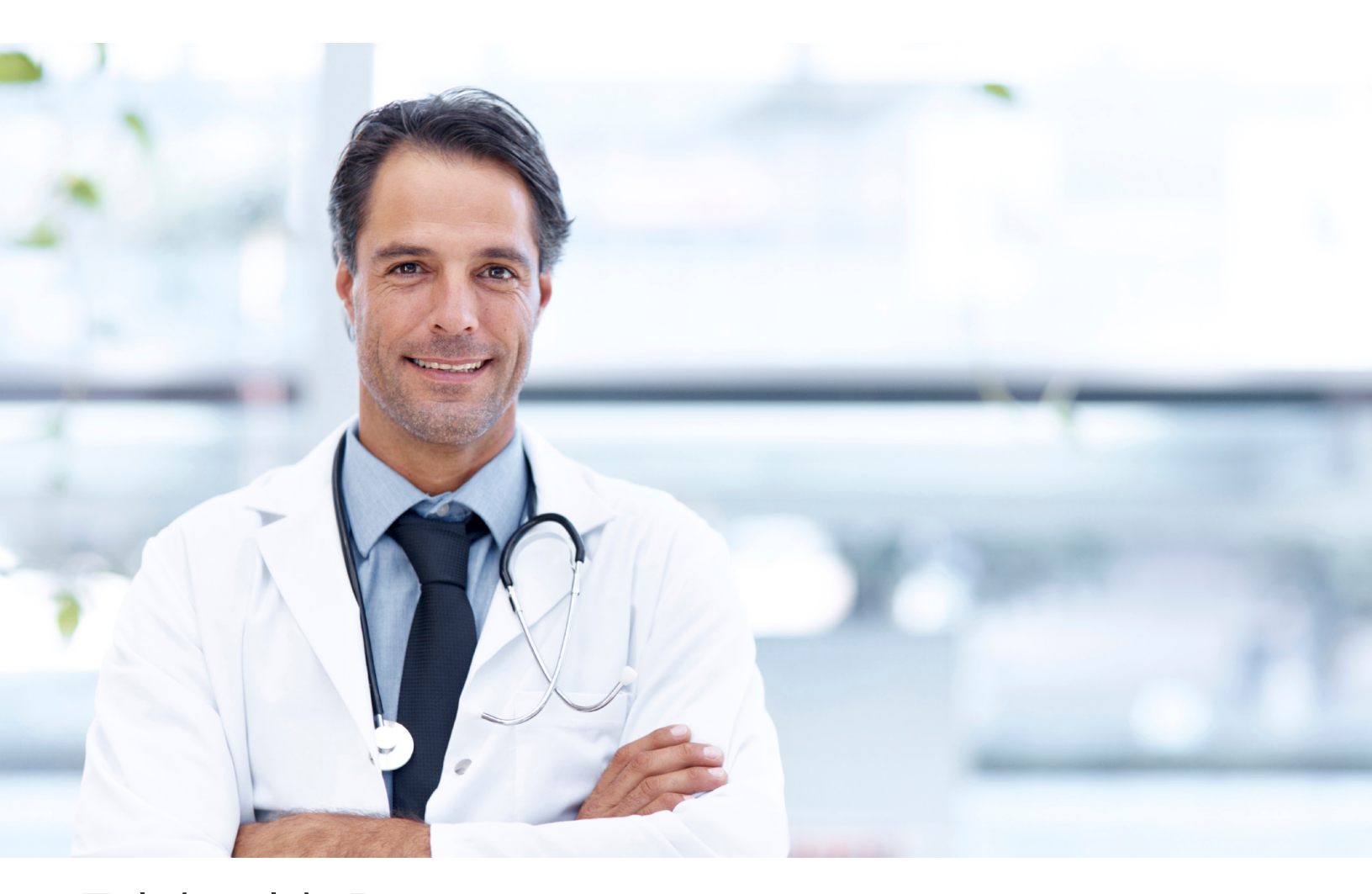
Telehealth Program Frequently Asked Questions