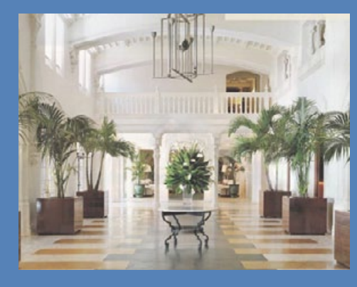
Monday, July 30

Close out the first day at our Strolling Dinner in the Valencia room