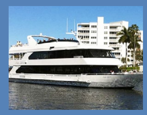
Tuesday, July 31

Meet and greet your hosts, your peers and the industry's top DDoS experts while enjoying the fantastic food from the Boca Raton Resort's kitchen: Rich Italian pastas, Five-Pepper Tenderloin at the carving station, fresh sushi and a delectable array of desserts. Refuel after your afternoon in the sun!