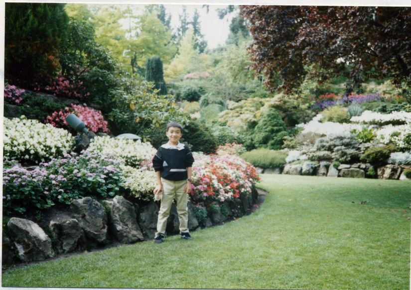
Just think! I built this place all by myself!