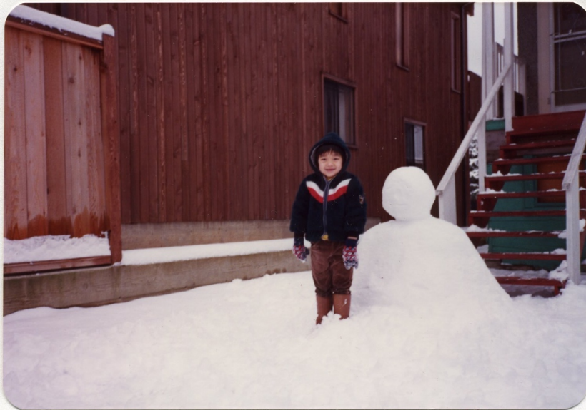
At last! Someone shorter than me!