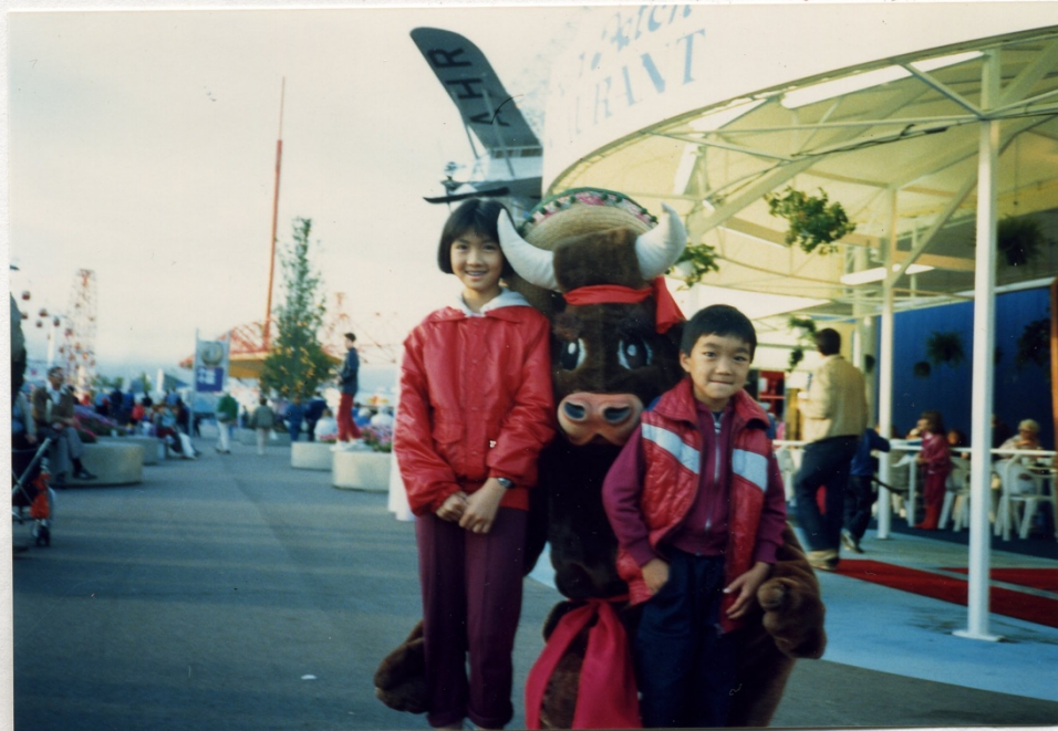
I think this guy's a lot of bull!