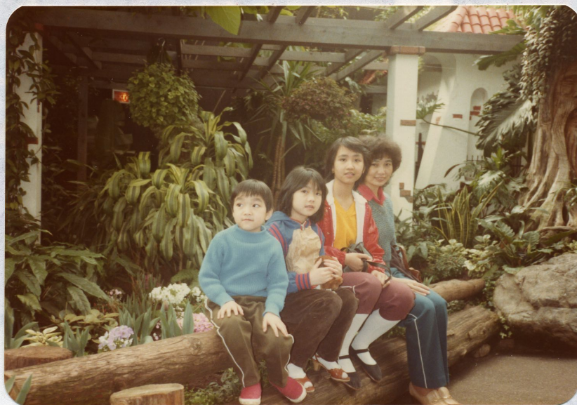
Will a bird come and drop some doo-doo on my head, mommy?