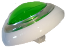
Button No.100 yellow Part Number: LP2-005