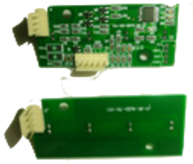
Optical Sensor D Part Number: LP2-001