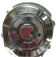
Lock & Key Part Number: LP2-009