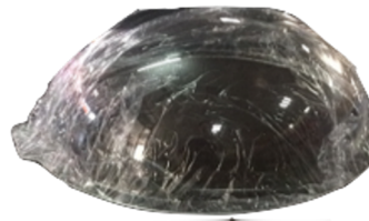
Dome Part Number: LP2-007