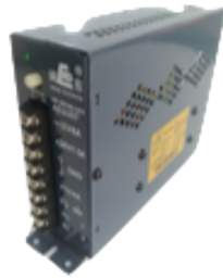
Power- MD-9916A-24 Part Number: LP2-002