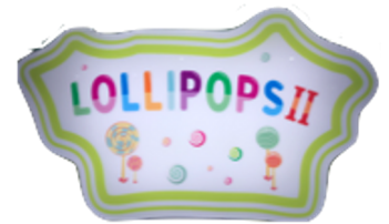
Marquee Part Number: LP2-008