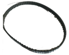
Belt Part Number: LP2-004