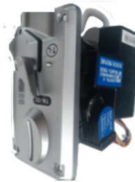
Coin Acceptor 131F Side Slot Part Number: LP2-003