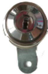
Lock & Key Part Number: LP-010