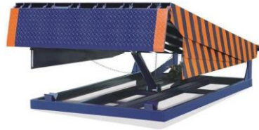
Fixed Boarding Bridge