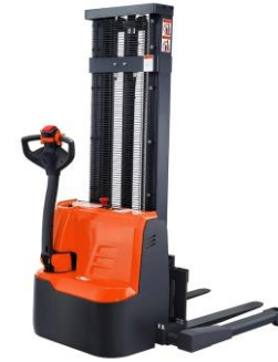
Electric Stacker Forklift