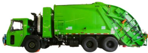
Closed System of Dump Truck