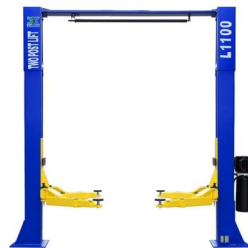
Lifter in Car Lift