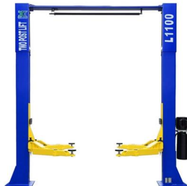
Lifter in Car Lift