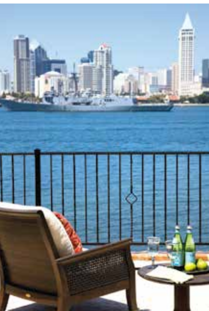
From this sunny deck chair, the skyline of downtown San Diego glistens in the distance.