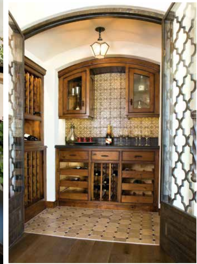
A lavish wine bar and vault make the estate ideal for parties or intimate gatherings.