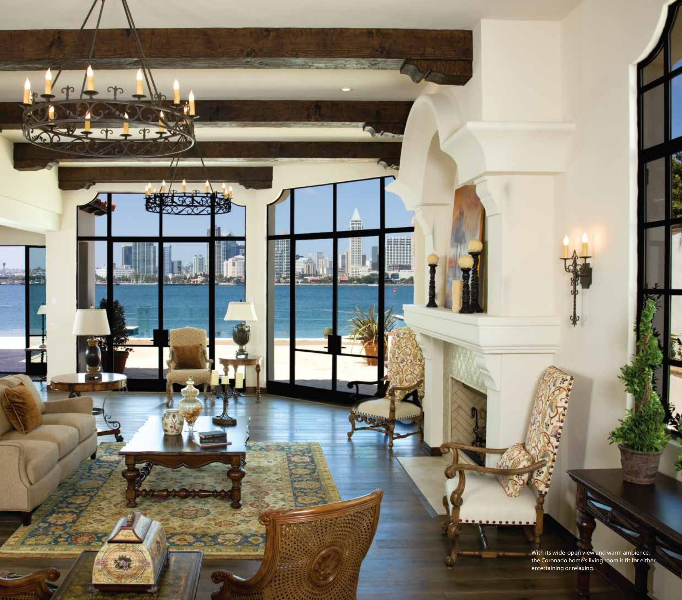
With its wide-open view and warm ambience, the Coronado home's living room is fit for either entertaining or relaxing.