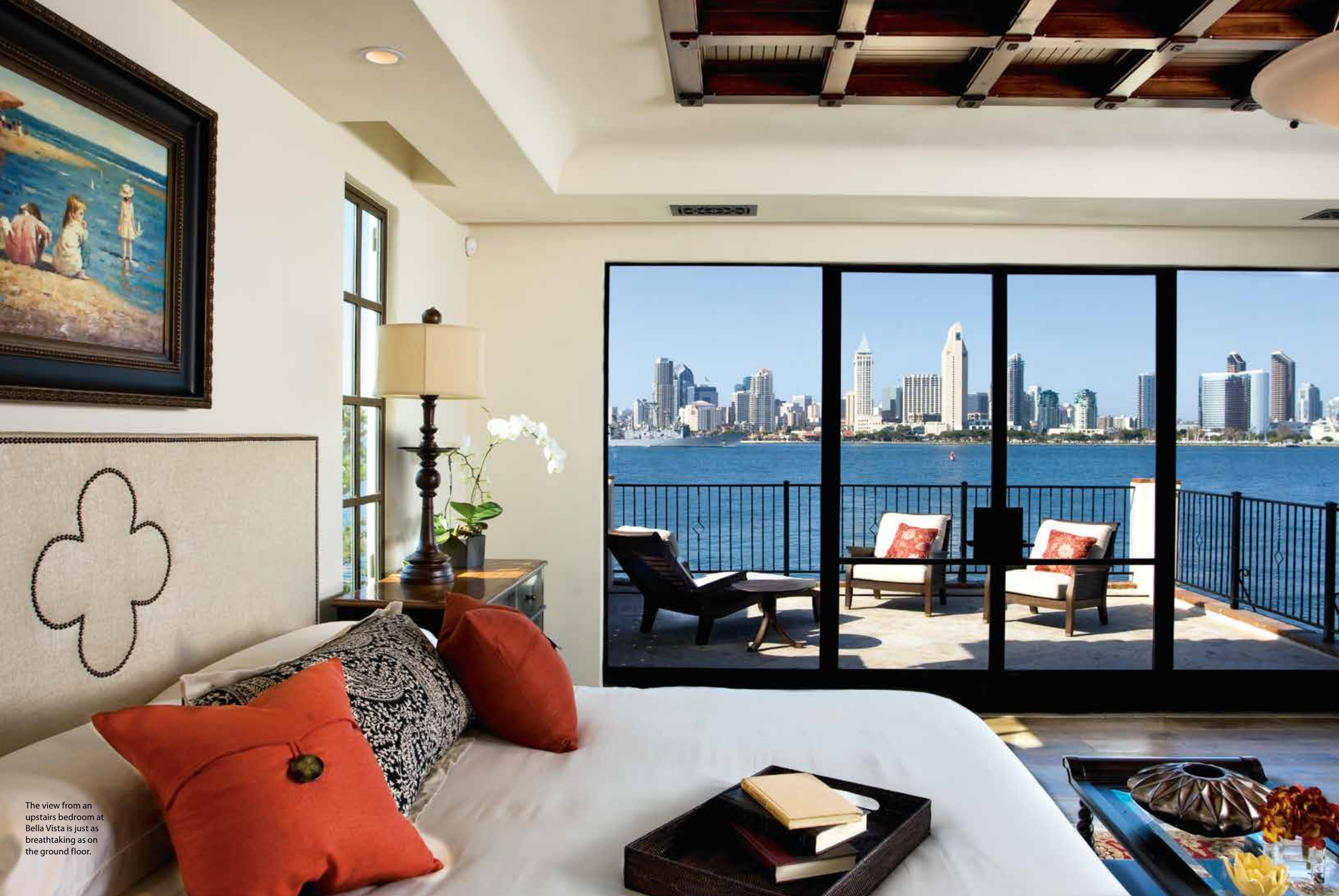
The view from an upstairs bedroom at Bella Vista is just as breathtaking as on the ground floor.