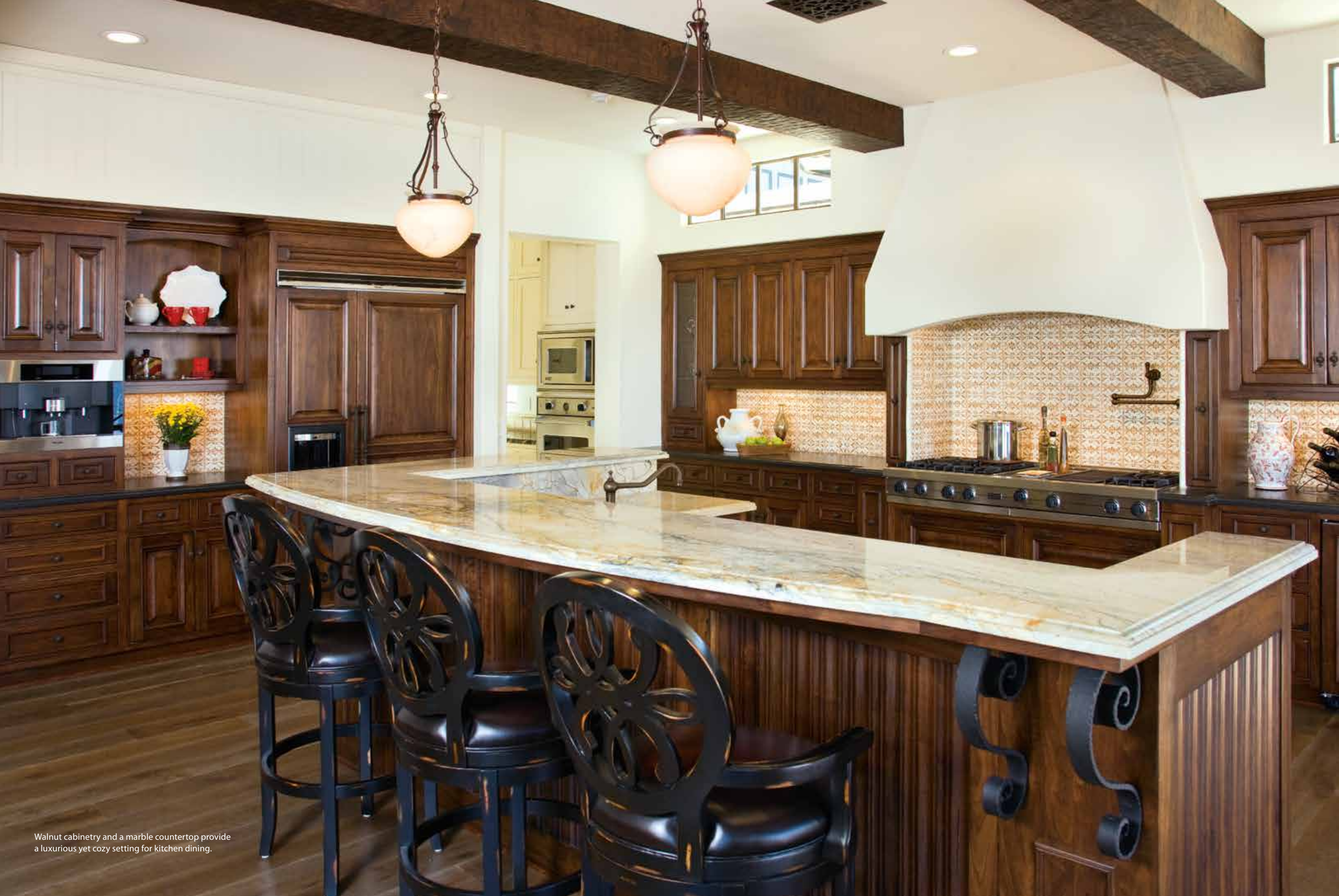
Walnut cabinetry and a marble countertop provide a luxurious yet cozy setting for kitchen dining.