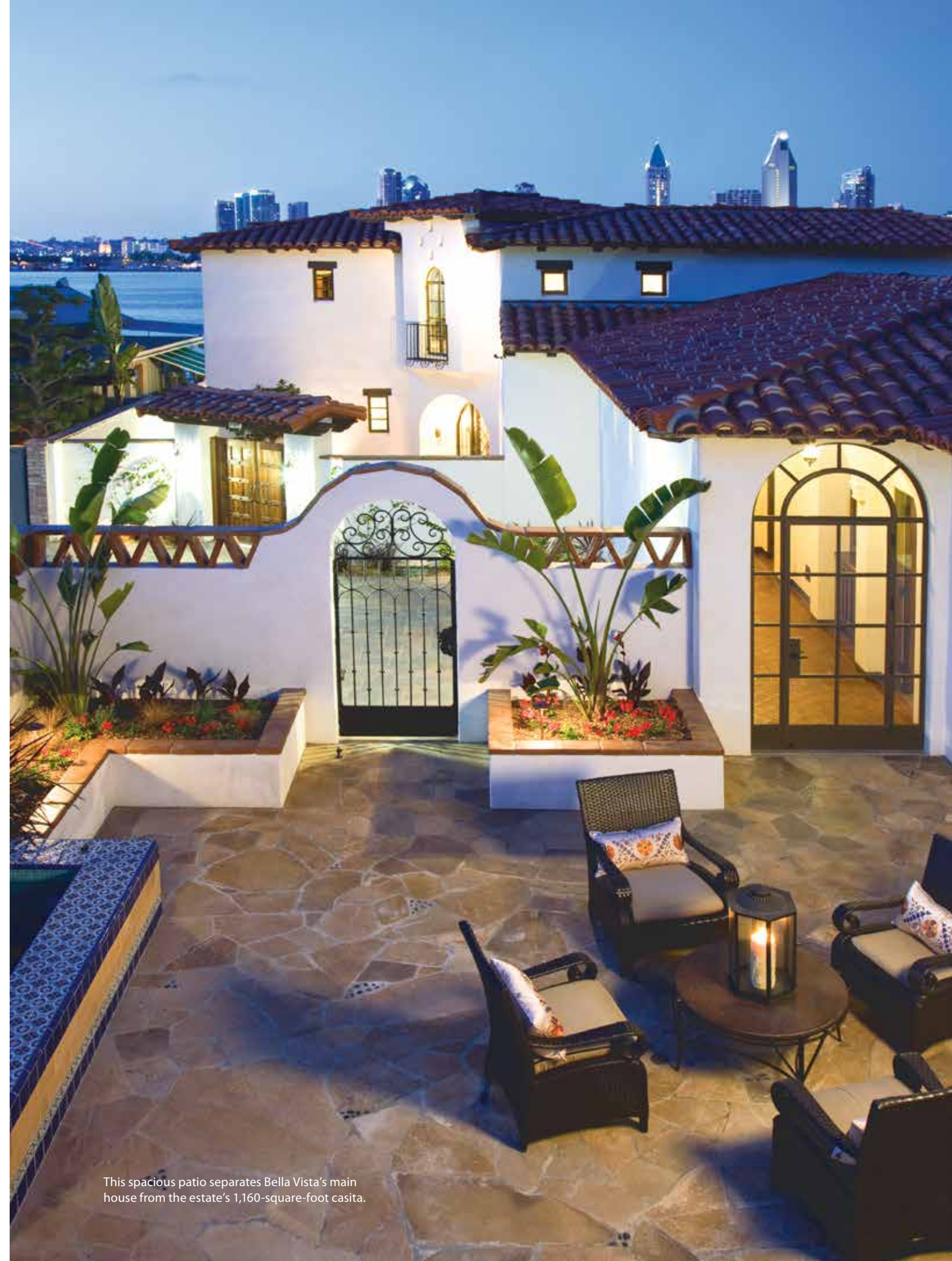
This spacious patio separates Bella Vista's main house from the estate's 1,160-square-foot casita.

WHERE TO FIND IT, PAGE XX More photos follow