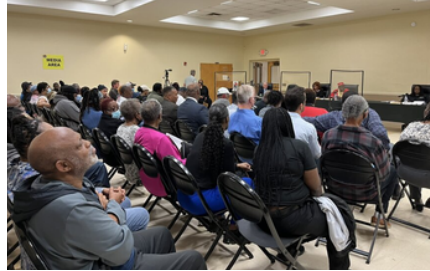
HUNGERFORD TOWN HALL MEETING