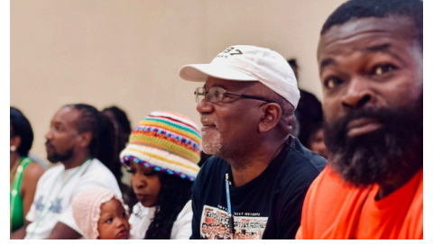
1887 FIRST COMMUNITY CELEBRATION