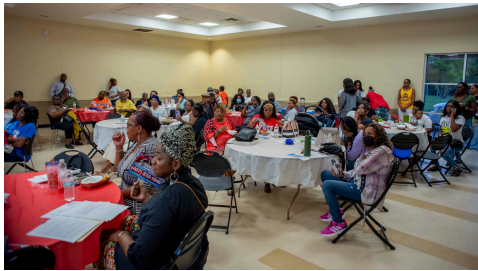
1887 FIRST GRILL & GATHER ELECTION Q&A