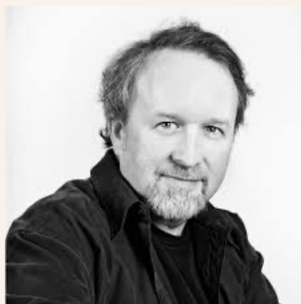
Michael A. Stackpole New York Times Bestselling Author