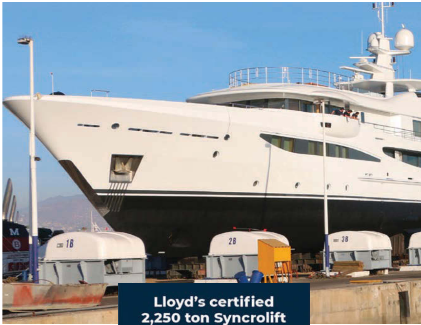
Lloyd's certified 2,250 ton Syncrolift 70 ton Travelift

granpeninsula.com ph. +52.646.178.8020 info@granpeninsula.com bajanaval.com ph. +52.646.174.0020 boatyard@bajanaval.com Ensenada, Mexico f i