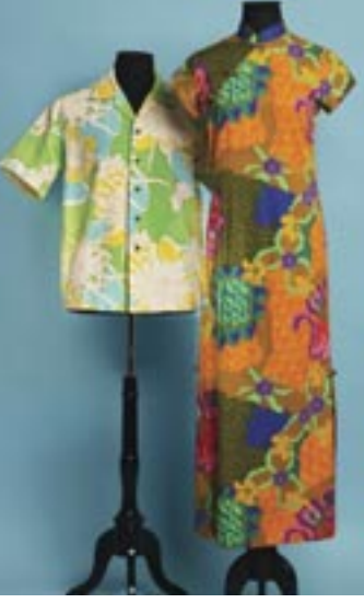
A few of the over 50 garments on display at the Fashioning Aloha exhibit.

Another source of inspiration for aloha-