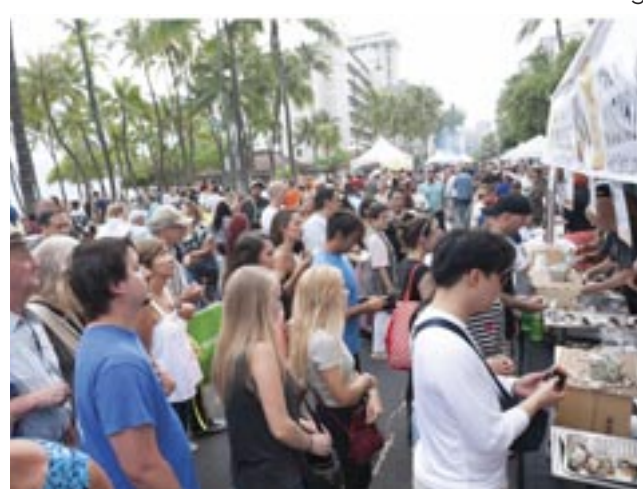
Crowds will fill Waikiki lining up to try as many of the delectable SPAM creations from 30 restaurants they can.

In honor of the 20th anniversary, there have been a few special activities added into the mix, including a SPAM® museum with photos, videos, and T-shirts from past SPAM JAM®