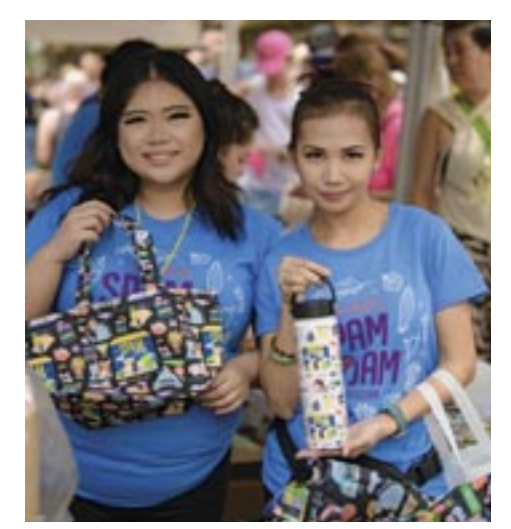
Don't miss the limited-edition logo good made by Eden in Love at the pop-up at Outrigger Waikiki or at the festival itself.

Organizers are also opening a Pop-Up Shop at the Outrigger Waikiki, offering people the opportunity to purchase the 2024 festival shirts made exclusively for the 20th anniversary, SPAM® logo goods, and exclusive Eden in Love collaboration bags in advance of the festival so they don't have to walk the block party with all of their purchases, leaving both hands free to grab more different SPAM® delights as they wander through the block party. Of course, if you miss the Pop-Up shop, a booth will also be set up during the festival.