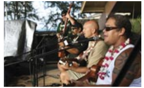
Plate lunch, shave ice, and cultural booths are plentiful. The talent line-up used to be up