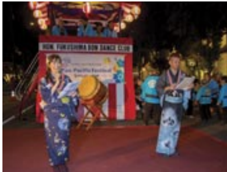
The Bon Dance will be at the Diamond Head side near Cheesecake Factory during the Ho'olaule'a