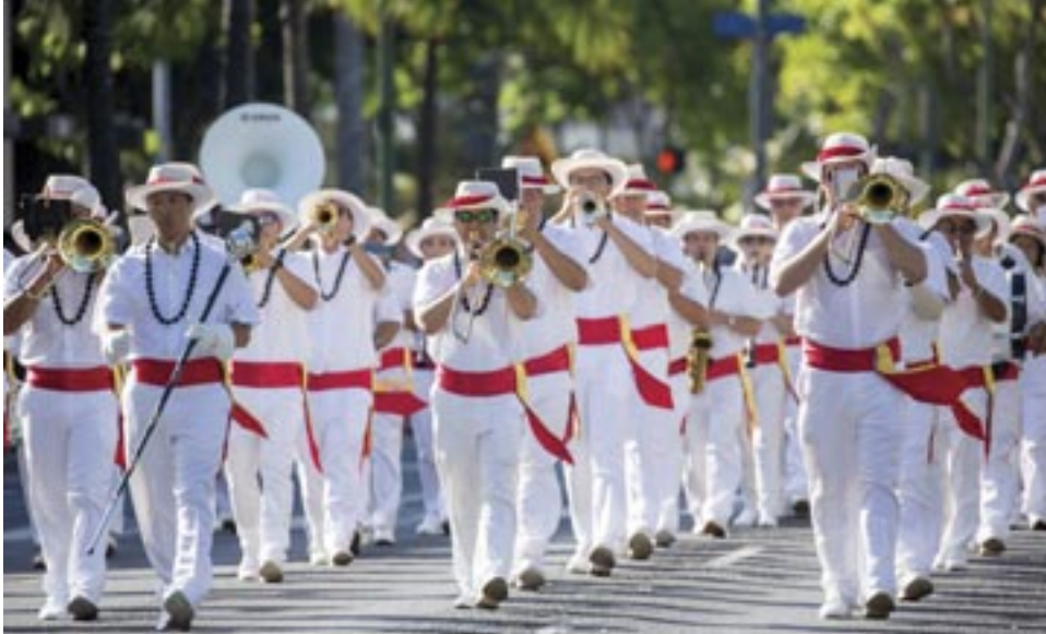
Get ready for the busiest weekend in Waikiki all year. The Pan Pacific Festival Parade closes out the weekend on June 14 at 5 p.m.