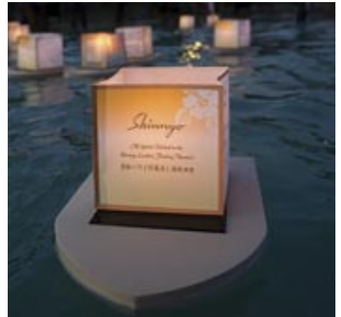
Tens of thousands will assemble on the beach at Magic Island for the 28th annual Floating Lantern Festival on May 25th.

Shinnyo Lantern Floating Hawai'i, the largest Memorial Day event in the U.S., will return to Ala Moana Beach on Monday, May 25, for its 28th year. Under the theme 'Many Rivers, One Ocean,' which represents shared journeys and interconnectedness, this treasured tradition draws residents and visitors from around the world to honor fallen service members and remember loved ones. The ceremony offers a time for quiet reflection, gratitude, and healing, peaking at sunset with the release of 6,000 candle-lit lanterns carrying messages of remembrance, prayers, and affirmations along the shoreline, which are set afloat on the water to carry your gratitude and prayers for all spirits and forms of life that came before us.