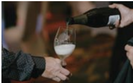
The wines are always fabulous!

Beard Award finalists and winners on that list alone!) There are also 32 winemakers, proprietors, Master Sommeliers, and 25 mixologists, including several members of the highly revered Bar World 100, an annual list of the world's most influential figures in the bar industry. Here's what we can look forward to on Oahu.