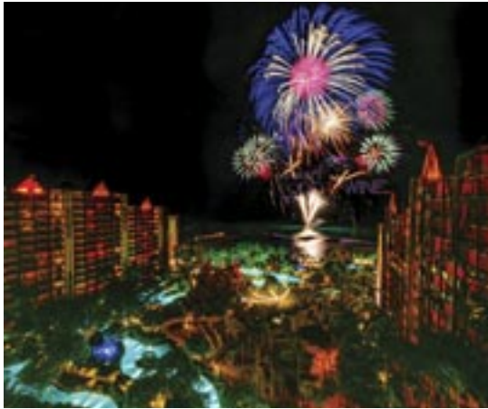
Don't miss HFWF's stunning finale.