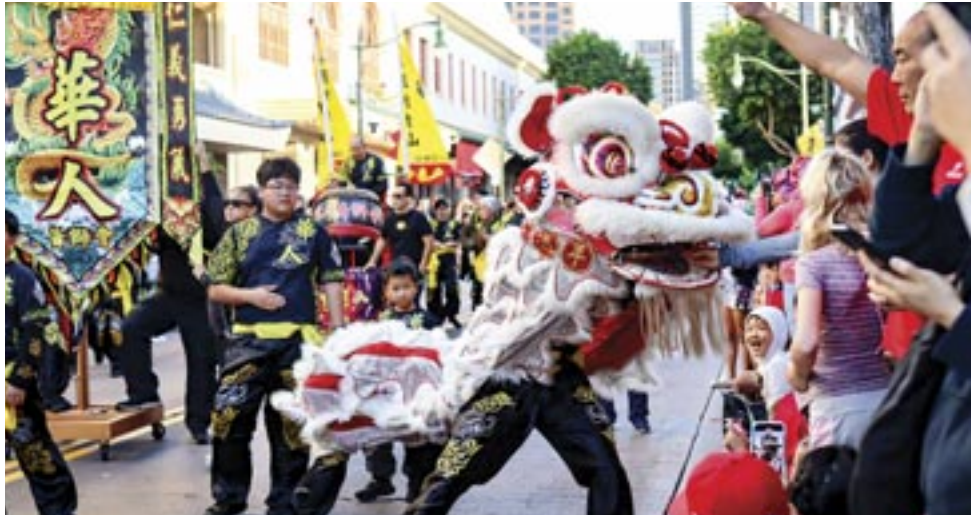
The Chinatown Parade, taking place on February 14, is always a draw.

For thousands of years, long before the advent of dates and printed calendars, people kept track of time by observing the sky. The moon—whose cycle of rising, waning, disappearing, and reappearing—served as humanity's earliest clock. From this consistent lunar cycle, one of the oldest continuous traditions in the world arose: the Lunar New Year.