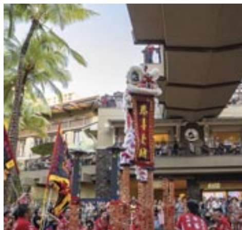
Don't miss the lion dance at The Royal Grove.

The parade starts at the Hawaii State Capitol lawn at 4:30 p.m., with participants in their best Lunar New Year costumes. Enthusiastic participants will march down Hotel Street toward Chinatown. Spectators can enjoy lion dance and dragon performances, see festival queens and their courts, and watch local cultural groups, kung fu martial artists, and dignitaries. After the parade, an opening ceremony will take place at 6 p.m. on the Aala Park Stage. For more details, visit chinatown808.com .