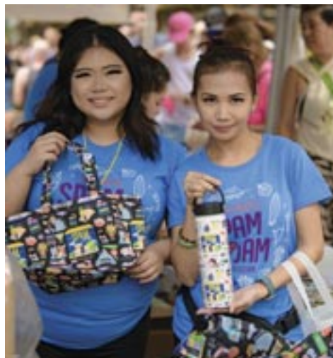
Don't miss the limited-edition logo good made by Eden in Love at the pop-up at Outrigger Waikiki or at the festival itself.

Organizers are also opening a Pop-Up Shop at the Outrigger Waikiki, offering people the opportunity to purchase the 2024 festival shirts made exclusively for the 20th anniversary, SPAM® logo goods, and exclusive Eden in Love collaboration bags in advance of the festival so they don't have to walk the block party with all of their purchases, leaving both hands free to grab more different SPAM® delights as they wander through the block party. Of course, if you miss the Pop-Up shop, a booth will also be set up during the festival.