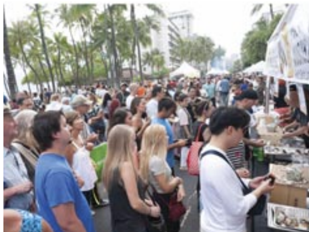
Crowds will fill Waikiki lining up to try as many of the delectable SPAM creations from 30 restaurants they can.

Guests can enjoy creative SPAM® dishes like Hoisin SPAM® Bao Buns w/ Kim Chi from Moani Waikiki for $9. A total of 30 restaurants will be participating in SPAM JAM®, including Aloha Beer, Blue Water Shrimp & Seafood, Buho Cocina Y Cantina, Dukes Waikiki, Eating House 1849, Hula Grill Waikiki, La Bettola, Maui Brewing Co., Stripsteak, and 604 Restaurant. Guests can enjoy live entertainment from local musicians at