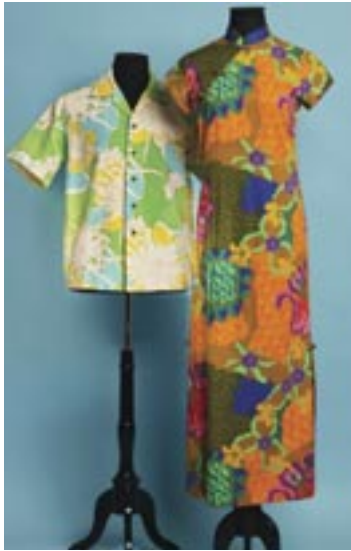
A few of the over 50 garments on display at the Fashioning Aloha exhibit.

"Aloha" is not just a word; it's a way of life, representing a spirit of warmth, affection, and mutual respect for others and the natural world. It's also the name of the clothing associated with Hawaiian culture, its colorful patterns and casual comfort reflecting the laid-back lifestyle of Hawaii. Beyond a fashion statement or tourist souvenir, Aloha wear is recognized worldwide and symbolizes local identity.