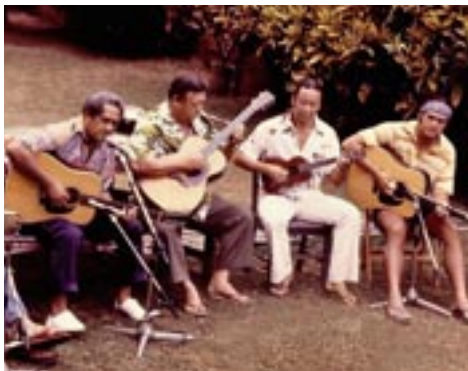
Jamming in Waimanalo back in 1978.